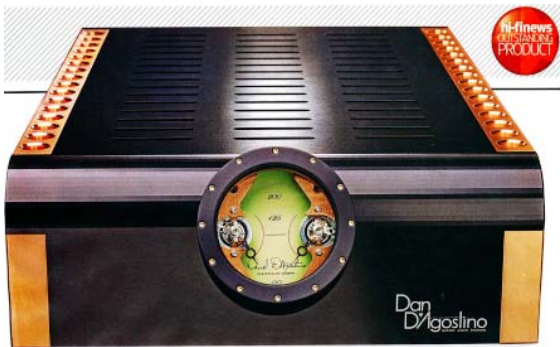
RIGHT: Rows of stepped venturis are drilled into the massive solid-copper side sections, cooling eight pairs of Sanken power transistors per channel. The main power transformer lies underneath the smaller toroid seen here